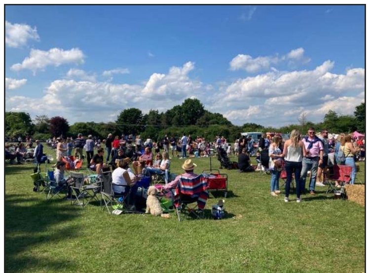
Meanwhile on the recreation ground crowds had already gathered to enjoy the sunshine, picnic and celebrate.