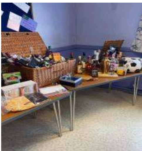
The raffle at the Jubilee Celebrations on 2nd June raised £500 for Harlow Food Bank

The Tesco National Food bank days on 1, 2, & 3 July collected 2.1 tons of food in Harlow.