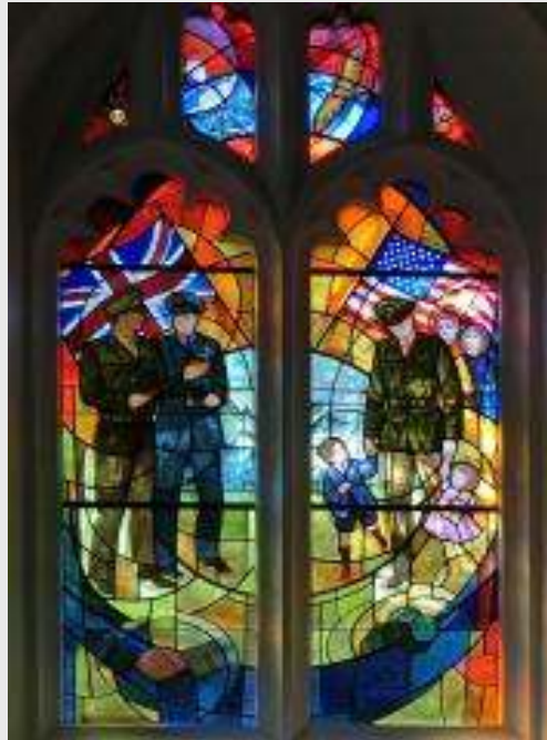
St Mary the Virgin Little Easton

When you are out and about, I hope you will pause to look in our churches at the wonderful range of craftsmanship, some old and some not so old.