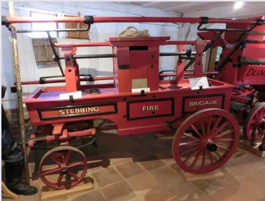
Great Dunmow Museum

Great Dunmow Museum is housed in a former maltings. It encompasses displays about its former function as well as broader elements of Dunmow history. Forge Museum in Much Hadham includes metal tools from the forge, while its own medieval wall paintings reveal an insight into Tudor fashion. Still in