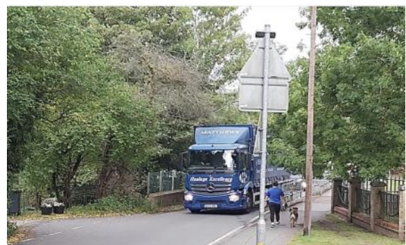
Lorry using Sheering Mill Lane reported on social media

Problems with speeding traffic and HGV lorries using inappropriate routes have continued. Although we had a meeting with our County Councillor and the Head of Highways plus Highways officers earlier in the year, they are still being chased for a solution and a budget to put to a public meeting. They have said that they should have a proposal together before Christmas. As a parish council, we have put aside funding to contribute towards this if necessary. Thanks to so many members of the public for photographs