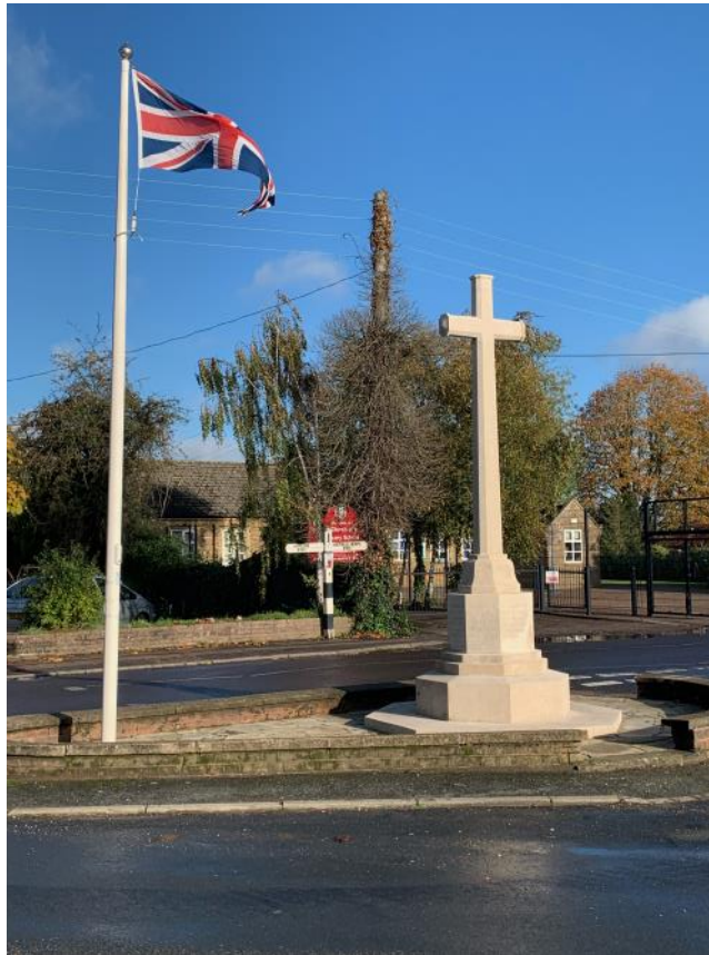
The newly renovated War Memorial

itself with a crusader's sword carved on the face. The whole stands about 13ft. high and is enclosed within a neat chain fence, having iron posts with brass tops. On four alternate faces of the die are the 20 names of the fallen and on the remaining four faces are inscriptions, as follows: -